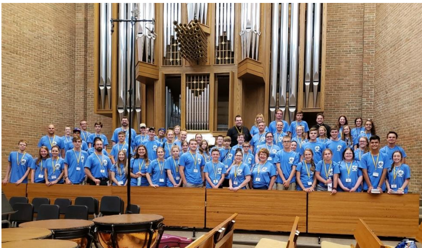
Indiana attendees to Higher Things, Concordia Chicago, 2019

Thank you for your prayers and support during this past trip, and we do hope to include even more youth in our next trip. Next year’s theme is “Watermarked.” Conferences will be held in Fort Collins, CO (June 29-July 2); Maryville, MO (July 7-10); Knoxville, TN (July 14-17); and Grand Rapids, MI (July 21-24).